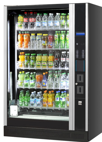
SandenVendo G-Drink vending machine based on SANDEN CO 2 technology

The SANDEN group has developed unique knowledge in CO 2 technology encompassing a large panel of applications. SANDEN manufactures CO 2 heat pump water heaters, vending machines and retail refrigeration systems worldwide.